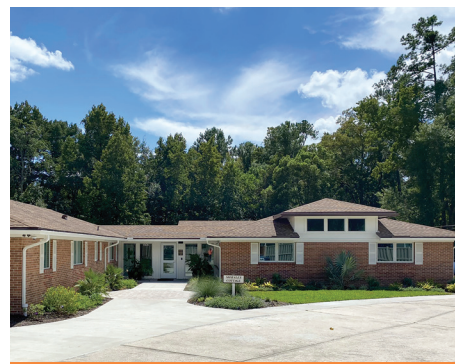
The recently renovated Morales Cottage began housing kids in crisis Oct. 16.

Daniel continues to raise money to transform the cottages on its campus to give kids the best possible environment in which to heal. If you'd like to contribute toward renovating the cottages in the residential treatment program, please contact Dave Cognetta at (904) 296-1055, extension 1033.