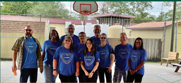
A volunteer group from VyStar Credit Union came out to play games and provide pizza for our kids and staff.