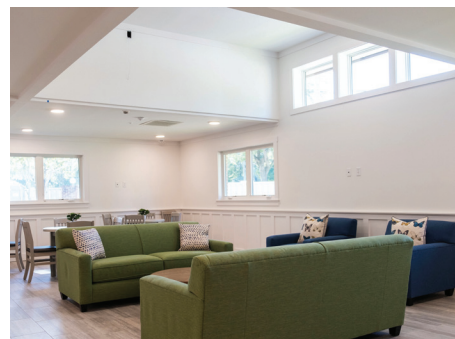
The new activity area offers youth a bright, welcoming environment.

* Names have been changed to protect privacy.