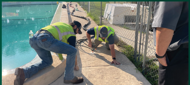
Alpha Foundations repaired our concrete pool deck to make it safe for our kids.