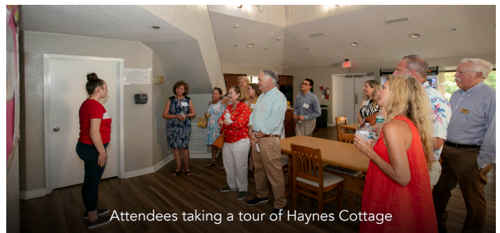
Attendees taking a tour of Haynes Cottage