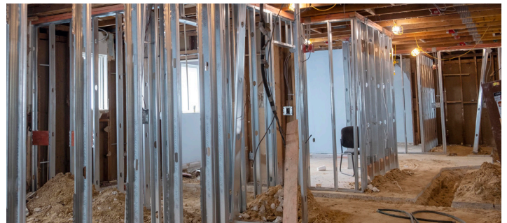
Construction and renovations are underway at Creekside-Cedarwood Cottage, while funds are still being raised to restore Midview Cottage.