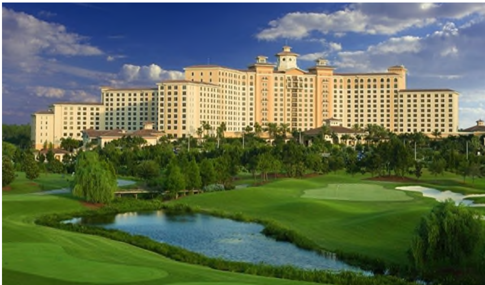
Orlando's crown jewel, the 1,501-room AAA Four Diamond Rosen Shingle Creek.