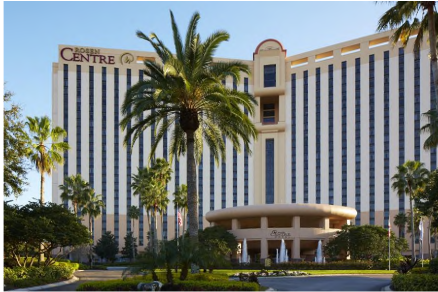
Soaring 24 stories, a beacon on International Drive, Rosen Centre -- along with sister property Rosen Plaza -- ideally bookend the Orange County Convention Center.